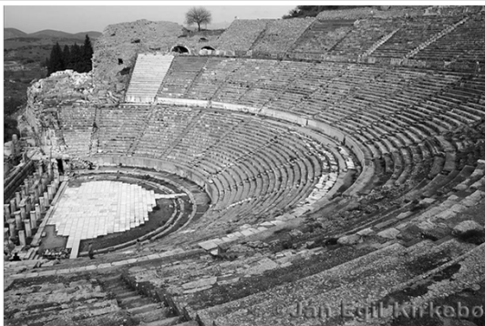
Theater at Ephesus (capacity: 24,000)